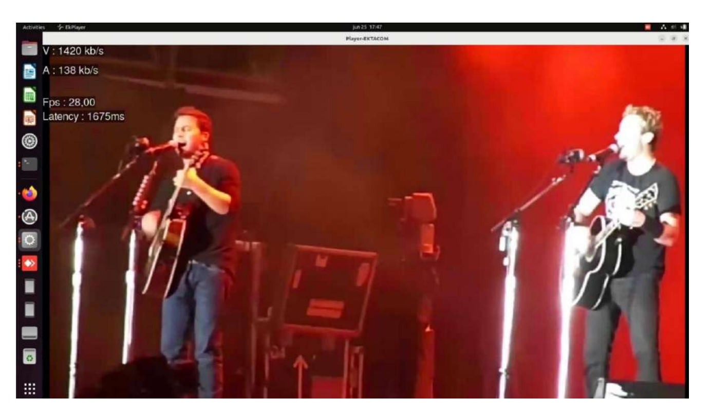
Figure 10: Player running the video session

The log displayed in Figure 11 provides detailed KPI data, specifically focusing on the Bitrate metric, which is crucial for evaluating the performance and quality of the video streaming sessions. The recorded values (for instance, 1312 kbps and 1346 kbps at 10:00:00, and 1186 kbps and 1226 kbps at 10:00:10), are within acceptable ranges, suggesting that the network is capable of maintaining a high-quality video transmission.